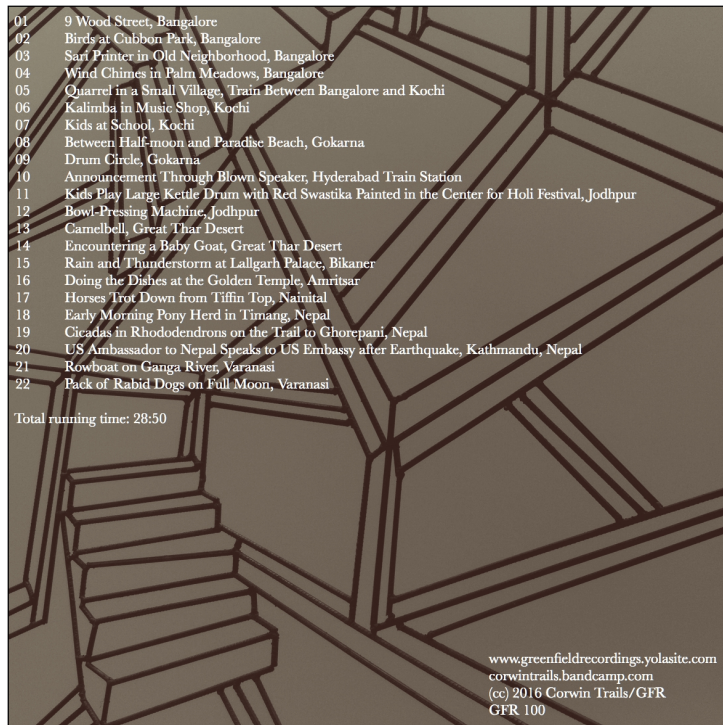
GFR | 05.2016